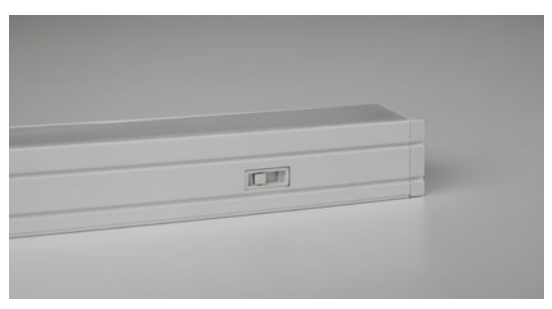
Standard three selectable CCT 3000K, 3500K, 4000K